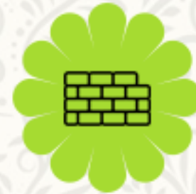
6.5 feet Compound Wall